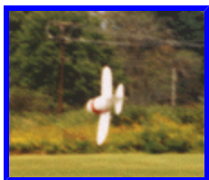
Take-Off, Looks Good.