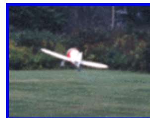
The Picnic, John Lavery and his GeeBee R-2,